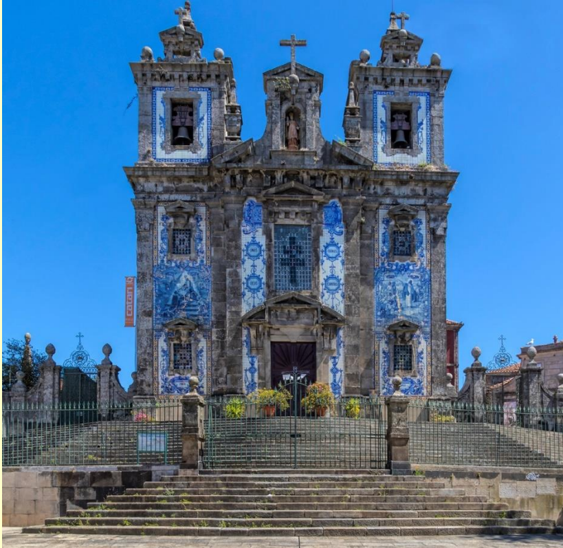
Church of Saint Ildefonso

Porto is a gem and not to be missed. It sits on the Douro River, and in the Ribiera district on the waterfront are many wonderful restaurants. Take an outdoor table and watch the traffic on the river and the lights come up on the Dom Louis 1 Bridge and the convent above and to the left of the bridge.