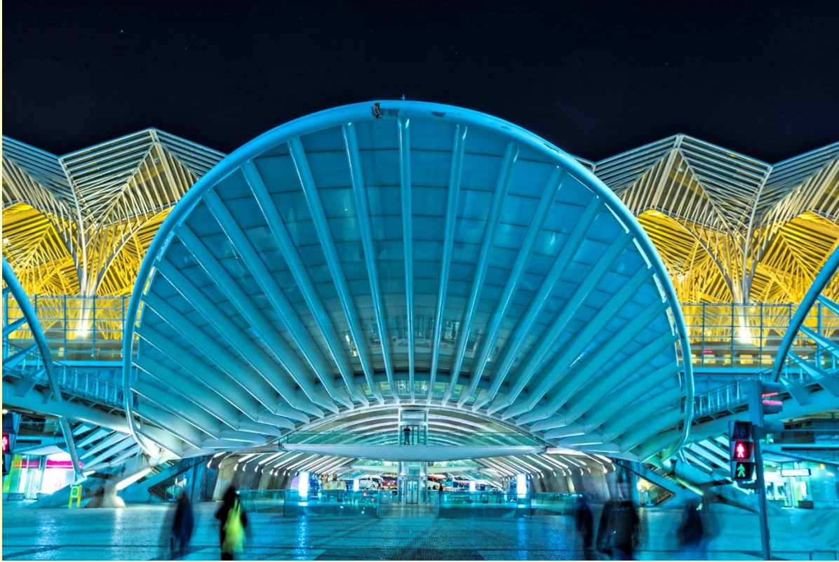
Entrance to Oriente Train Station

The Oriente train station is a must and again best viewed at night, and preferably at the blue hour.