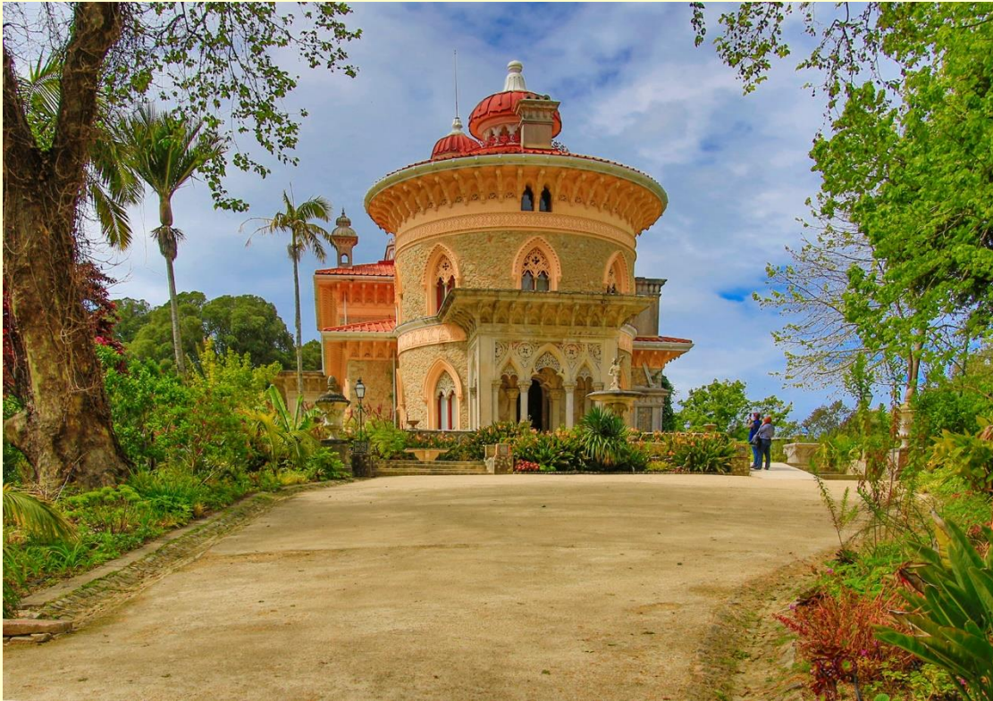
Entrance to Monserrate