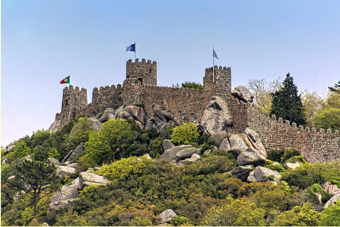
Moorish Castle Sintra.