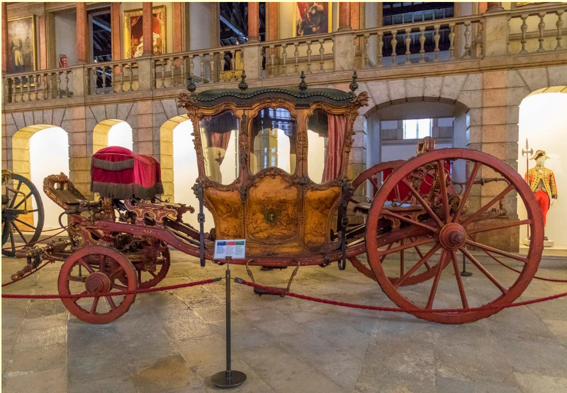
The National Coach Museum. Ornate, 16th–19th century royal carriages are displayed in an opulent, 18th-century palace riding arena.