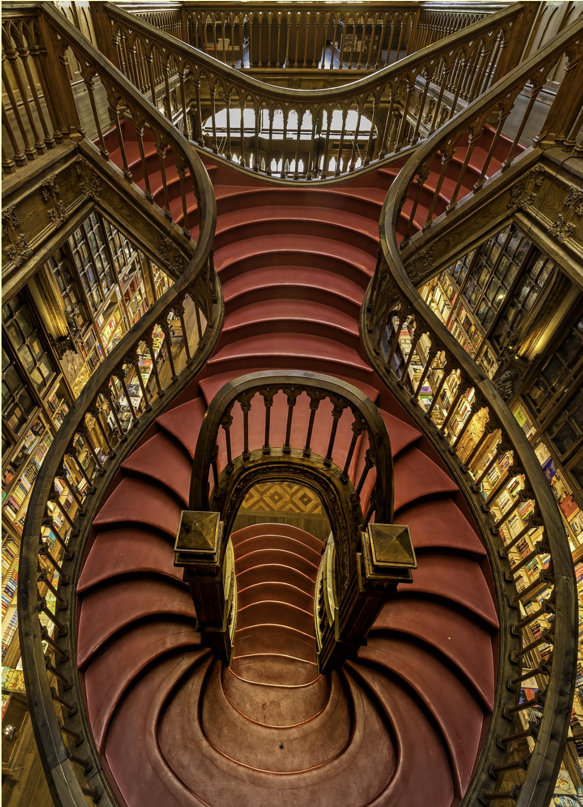
Looking down from above