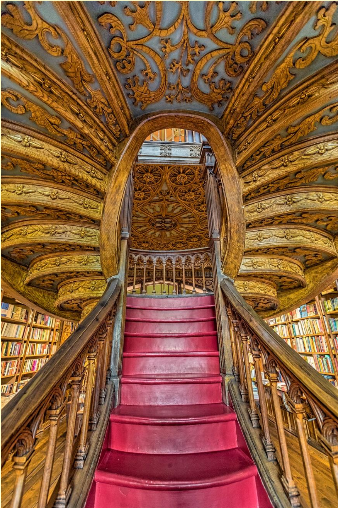
Entry to upstairs via the staircase