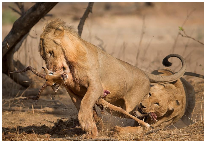
Predators In Action