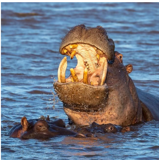
A Tooth Or Two