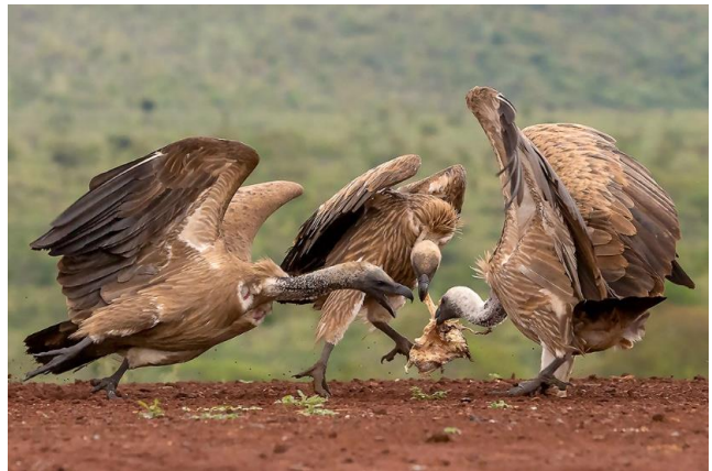
Fighting For A Share