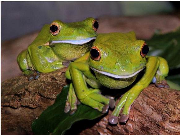
White Lipped Frog