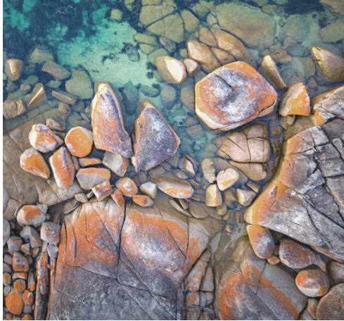
1st Place Australian Landscape/Seascape Tasmania Footprint by Timothy Moon

Congratulations to our all our first place winners for Topshot 2023.