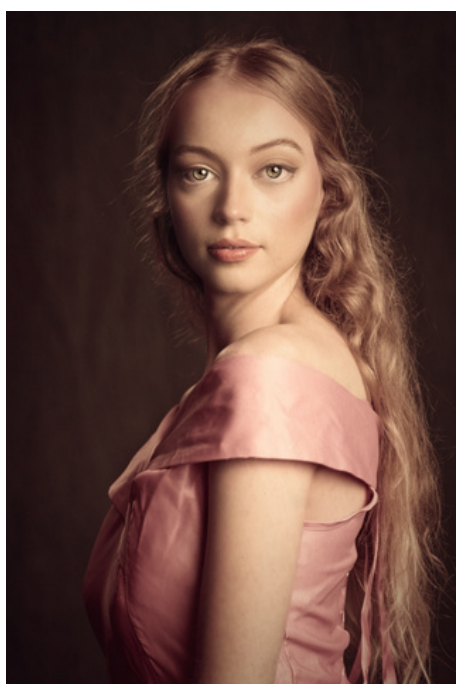
1st Place Colour Print Perfect by Paul Prouzos