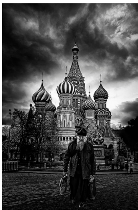
1st Place Mono Print - Storm Over St Basils by Kerry Boytell