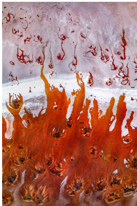
1st Place Drone/Aerial Salt Flames by Timothy Moon