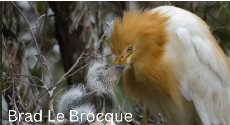
Brad Le Brocque