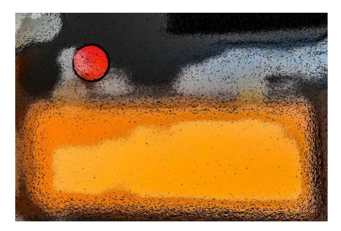
Scorched – Winner of the Northern NSW Zone "Abstract" Competition.

Winning entries can be seen at the <u>https://northnsw.myphotoclub.com.au/</u>