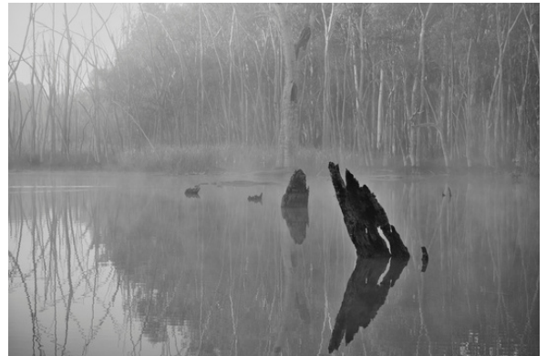
Spooky Forest Neil McAlicee Australian Landscape Digital