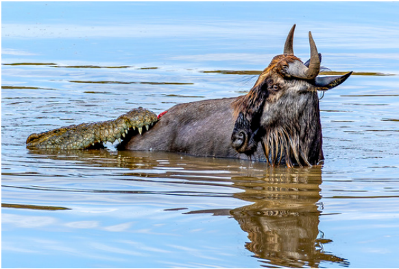
Wildebeest