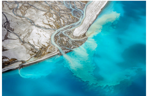
Spilling Out Nilmini De Silva Drone/Aerial Digital