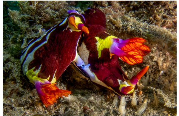
Beautifully Engaged Nembrotha Trevor Cotterill Nature Digital