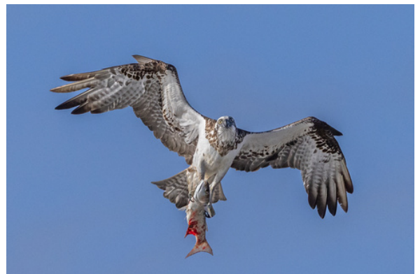
Fresh Catch