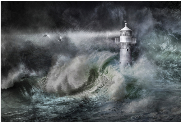
Lighthouse Tempest Timothy Moon Creative Digital