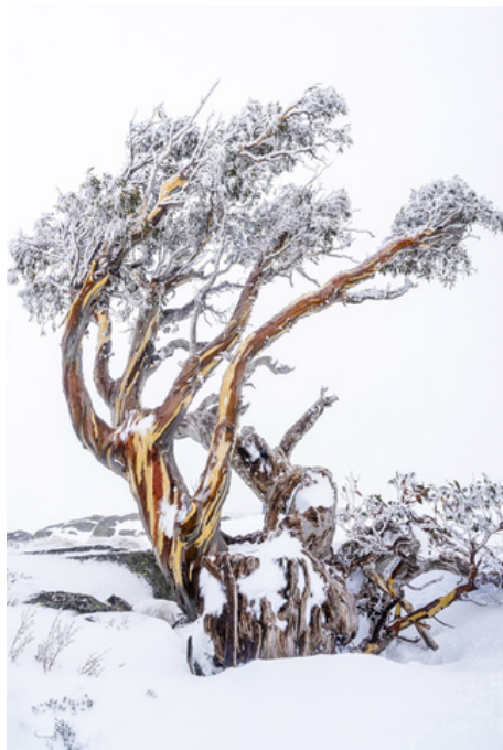
Twisted Snow Gum Robin Moon Australian Landscape Digital