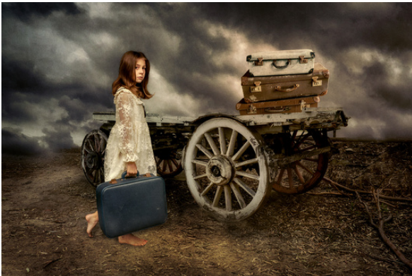
The Wagon Train Denise Perentin Creative Digital