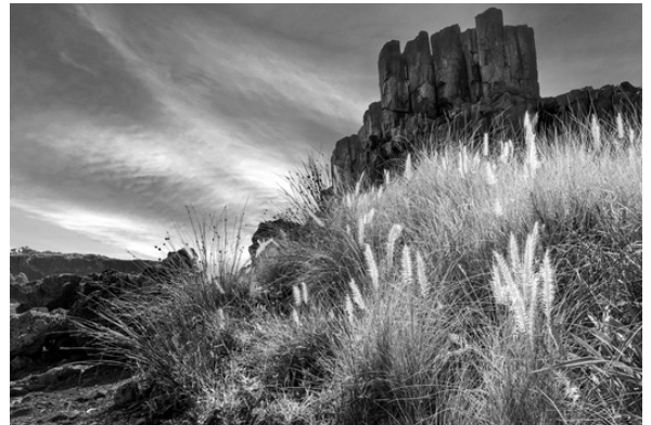
Bombo Grasses Sue Curtis Australian Landscape Digital