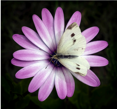
Beauty in Imperfection Barbara Blades Open Colour Print