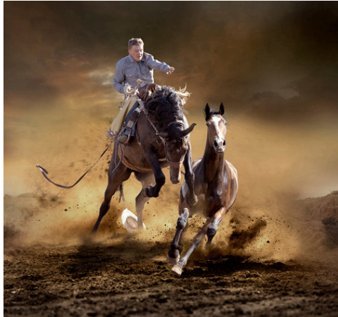
Graab It Yi Ping Xu Open Colour Digital