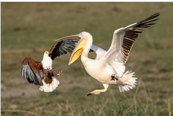
Mid Air Confrontation