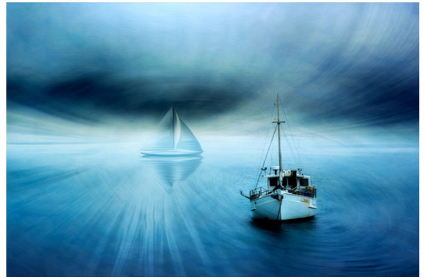
Sail Away Denise Perentin Creative Digital