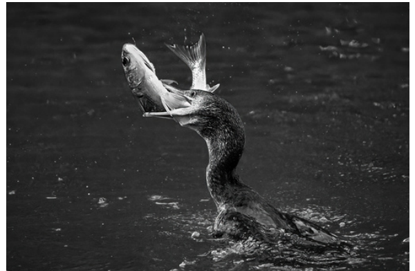
Breakfast Time Albert Hakvoort Open Mono Digital