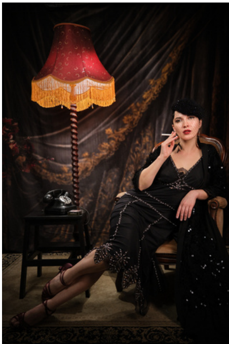
Gotta Light Suzanne Prouzos Open Colour Print