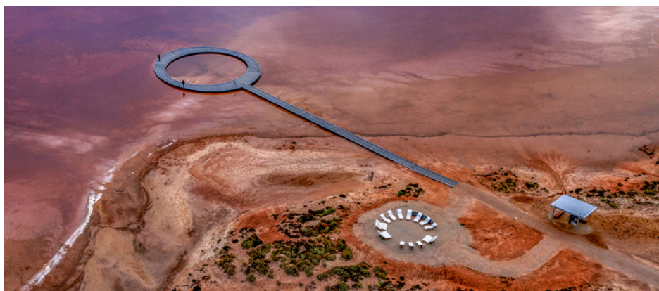
Lake Tyrell