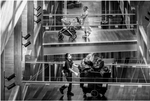
Future Tim Porteous Open Mono Digital