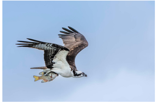
Ospreys Breakfast Kerry Boytell Nature Print