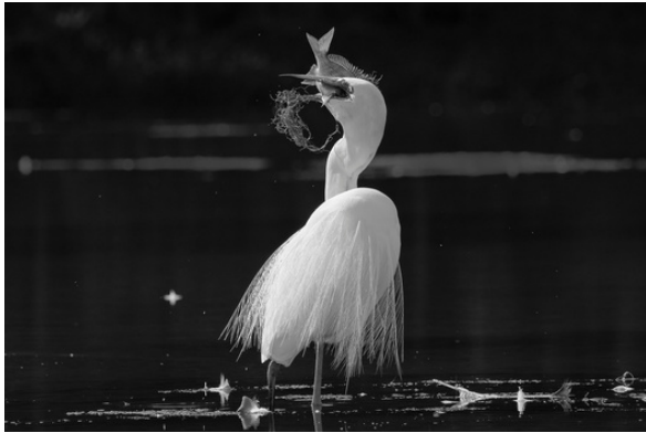
Seafood and Salad Arthur Roy Open Mono Digital