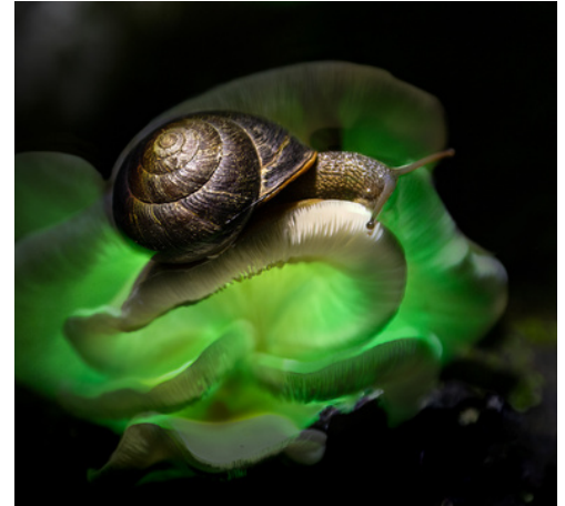
Snail on Ghost Fungi Sue Curtis Open Colour Digital