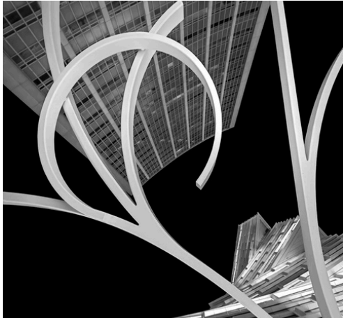
A Conversation Timothy Moon Open Mono Digital