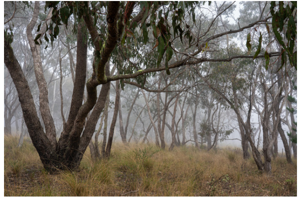
Trees in the Mist Sue Curtis Australian Landscape Digital