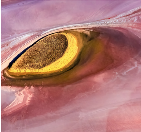
9.30am and 59 seconds Sara Corlis Drone/Aerial Digital